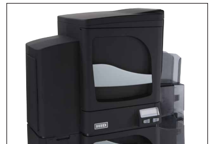
Custom overlaminates are available for a field-upgradable single- or unique, high-speed dual-sided simultaneous laminator.